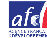
Agence Francaise de Developpement