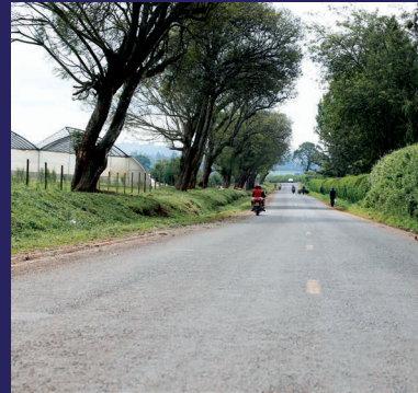
Completed section of the Ndumberi-Kiawaroga Limuru Road