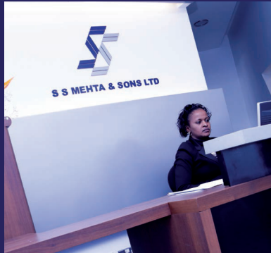
Executive offices at Eldama Park, Nairobi