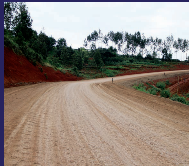
Base complete at a section of the Kangema-Gacharage (C70) Road