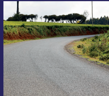
Completed section of the Ndumberi-Kiawaroga Limuru Road

Our equipment portfolio includes but is not limited to: