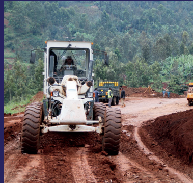
Works in progress at the Kangema-Gacharage (C70) Road