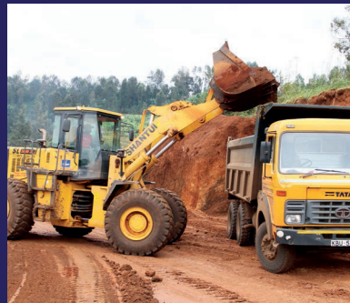
Ongoing earthworks on the Kangema-Gacharage (C70) Road