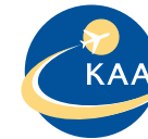
Kenya Airports Authority